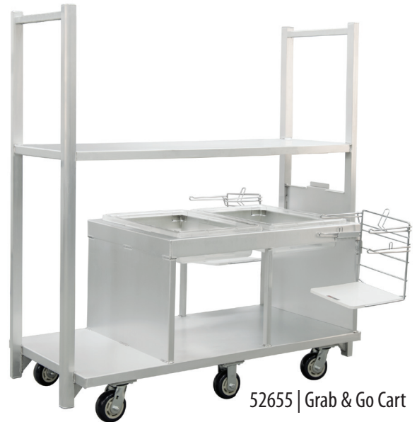
52655 | Grab & Go Cart