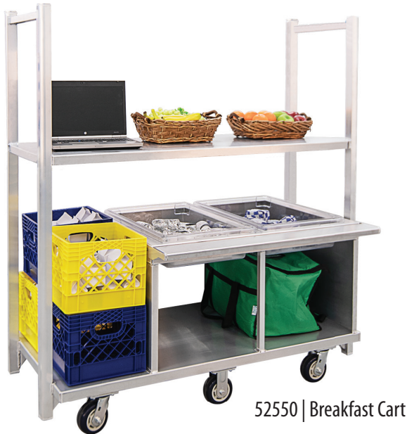
52550 | Breakfast Cart