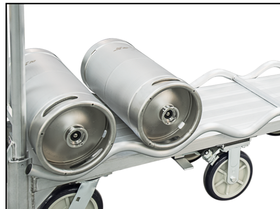
52064 | Holds up to 15, Sixth-Barrel Kegs