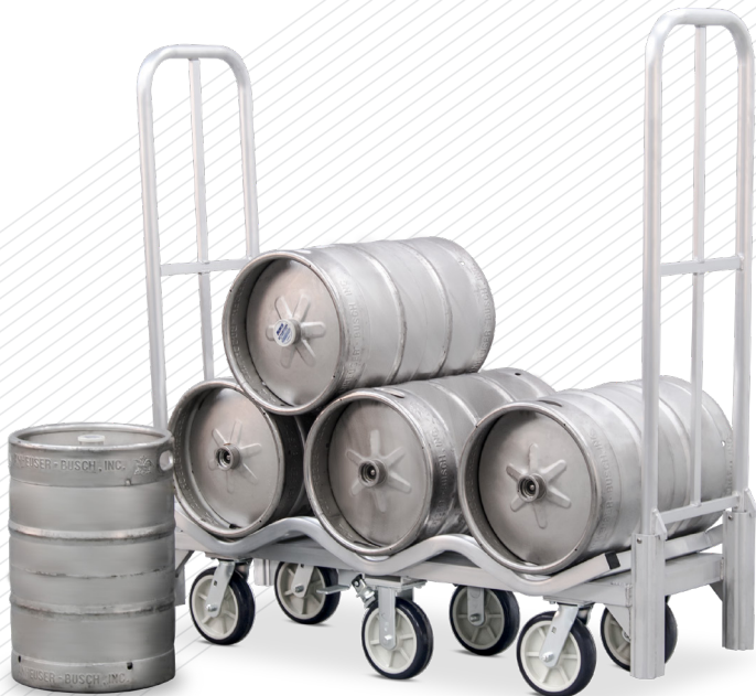
51753 | Holds up to 6, 15.5 Gallon, Half-Barrel Kegs shown with BDT18568B

All welded keg carriers nest securely on our BDT Trucks for safe, keg transport.