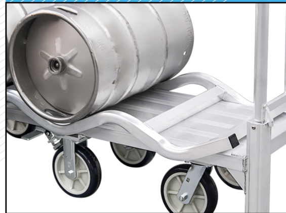
51753 | Holds up to 6, 15.5 Gallon, Half-Barrel Kegs