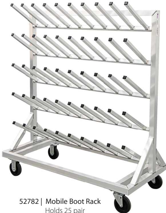
52782 | Mobile Boot Rack Holds 25 pair