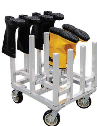
52665 | Mobile Boot Rack Holds 6 pair