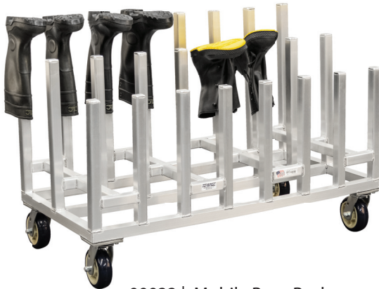
99933 | Mobile Boot Rack Holds 12 pair