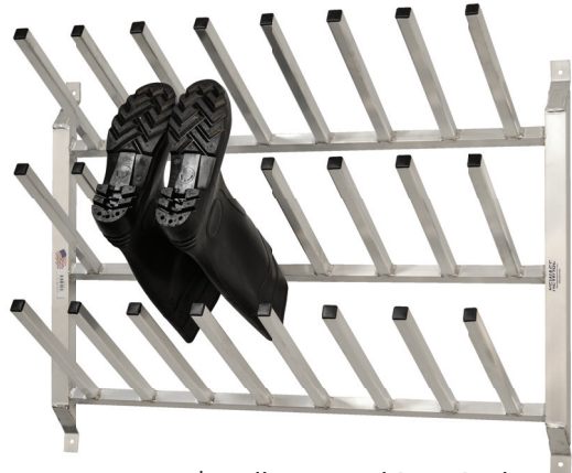
52518 | Wall Mounted Boot Rack Holds 12 pair