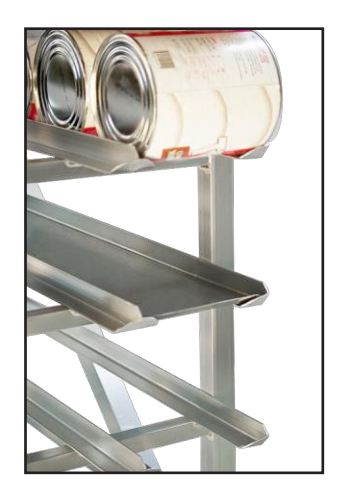
1255 Solid Shelf Trays