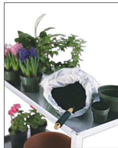
Spill Containing Shelves