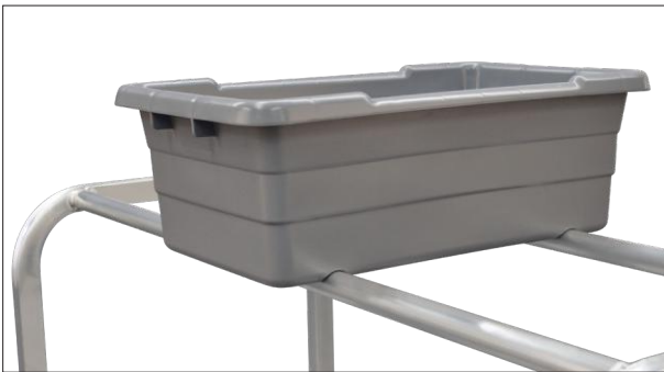
Lugs rest on heavy duty tube framework.