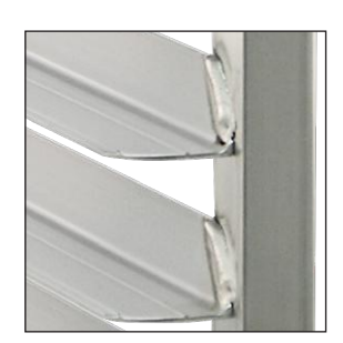
6000 Series Angle Guides and Welds