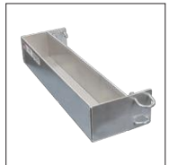
j. Document Tray