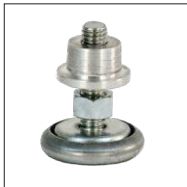
f. Adjustable Foot