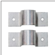
b. Wall Bracket