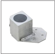
a. Floor Post Bracket