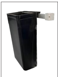
i. Trash Can