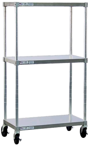
Adjustable Unit with Casters