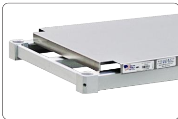
Solid Brute Shelf --Removable Top

Ideal for smaller, lighter items, solid shelves feature a smooth surface that is easy to clean and allows boxes to slide for effortless loading and unloading.