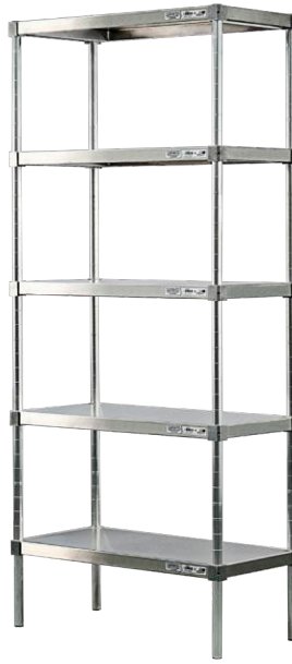
Adjustable Stationary Unit