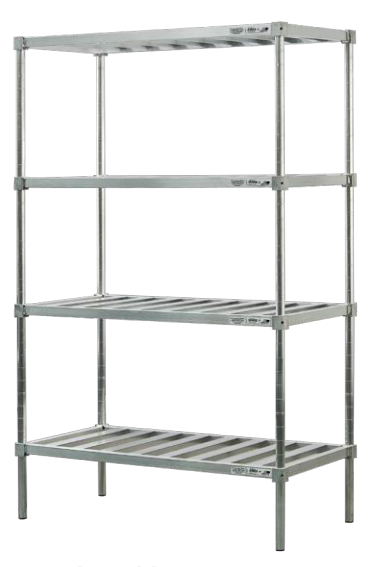
Adjustable Stationary Unit

The best of both worlds, T-Bar shelving provides a smooth, flat surface that is easy to clean and allows boxes to slide for easy loading and unloading.